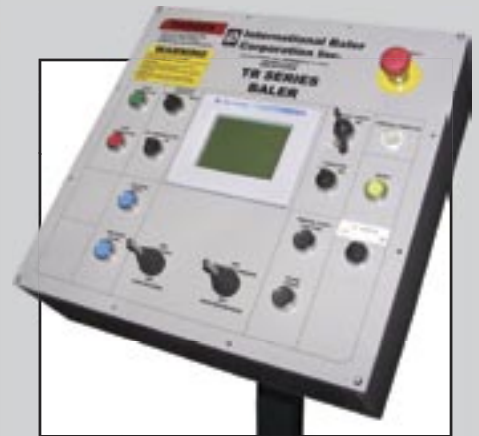
Available touch-screen controls and remote operator's stand simplify operation.